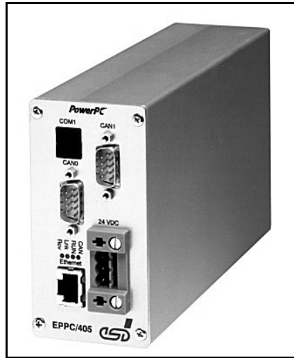
The EPPC-405 (I.2001.03) provides 2 CAN interfaces based on SJA1000 CAN -

The EPPC-405 comes with an ETHERNET interface for 10 Mbit/s and 100 Mbit/s nets. It is accessible as 10/100BaseT via RJ45 connector in the front panel.